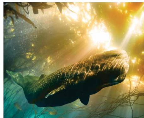
AMBER Amber, Woody, Dry

Decahydro-2,2,6,6,7,8,8-heptamethyl indenofuran